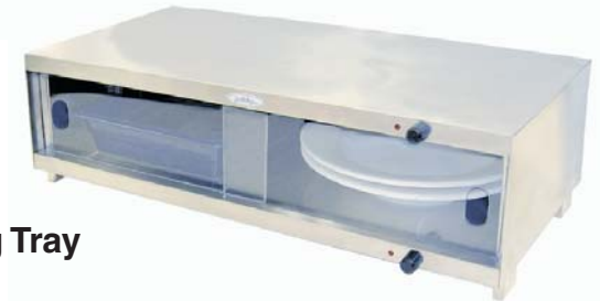
Model CMLW-C Warming Cabinet with Mid-Size Warming Tray (plates not included)