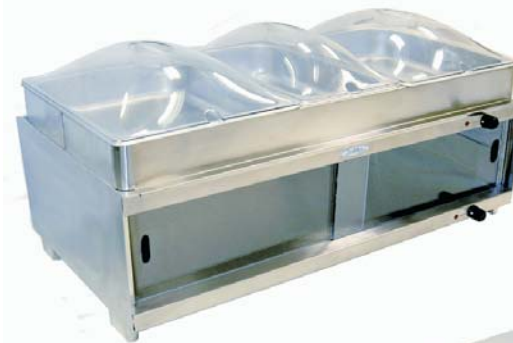
Model CMLB-CSLP Warming Cabinet with Mid-Size Buffet Server