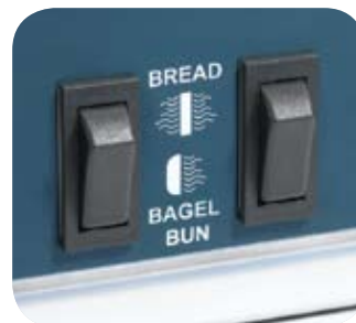
Bagel/Bun switch toasts the cut side and warms the other