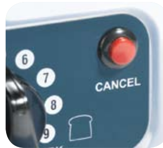
Cancel button lets operators stop the toasting cycle anytime