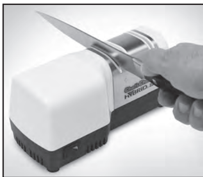
Figure 1. Inserting the blade in the left slot of the Stage 1. Alternate individual pulls in left and right slots.

Figure 2 illustrates how to check for the burr. Proceed as follows: If your last sharpening pull was in the right slot there should be a small burr on the right side of the blade edge. If the last pull was in the left slot there should be a small burr along the left side of the edge. If there is no burr make another pair of pulls and again check for a burr. Repeat making pairs of alter-