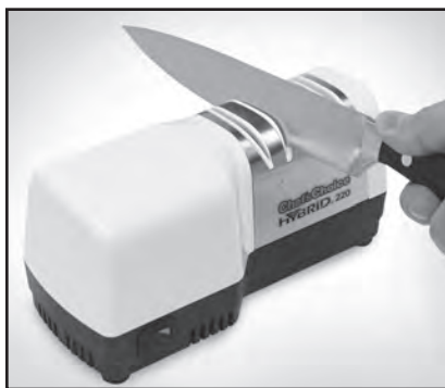
Figure 3. Inserting the blade in the right slot of Stage 1. Alternate pulls in left and right slots.

To resharpen follow the procedure for Stage 2 described above, making two to three (2-3) complete back and forth stroke pairs while maintaining recommended downward pressure. Listen to confirm the sharpening disks are turning. Then test the edge for sharpness. If necessary resharpen again but first use Stage 1 followed by two to three (2-3) back and forth pairs of strokes in Stage 2. Generally you should be able to resharpen several times using only Stage 2 before having to resharpen in Stage 1.