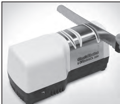
Figure 5. Serrated knife in Stage 2.

Do not sharpen in the Hybrid™ any single sided, single faceted Asian Kataba knives, such as the traditional sashimi styled blade that is commonly used to prepare ultra thin sashimi. Stage 2 sharpens simultaneously both sides of the cutting edge while the sashimi knives are designed to be sharpened only on one side of the blade. The Chef'sChoice electric sharpeners listed in the previous paragraph will correctly sharpen these single sided knives.