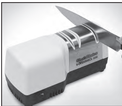
Figure 4. Knife in Stage 2. Use back and forth sharpening strokes with modest downward pressure. See text.