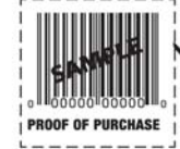
Sample UPC code. UPC code is located on the side panel of product packaging.

address to: Time Customer Service, Inc., P.O. Box 62160, Tampa, FL 33662-2160. Customer Service Phone Number: 1-888-474-2457 Offer status look-up: kitchenaid.rewardpromo.com